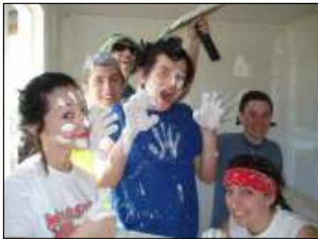
Mission to Mexico teens take a break June 1st, 2nd Service is a celebration of their recent trip—join the fun!

I was a freshman in high school returning from my first Mexico trip. My parents met us, my brother and me, at the church to bring us home. I remember when we arrived how odd it felt to be away from all the new friends I had met. Friendships that were formed through the common experience of finding ourselves in a foreign land with sights and sounds we were not accustomed to. It was a long trip, but a good trip, a trip on which God had allowed me, for the first time, to feel His presence.